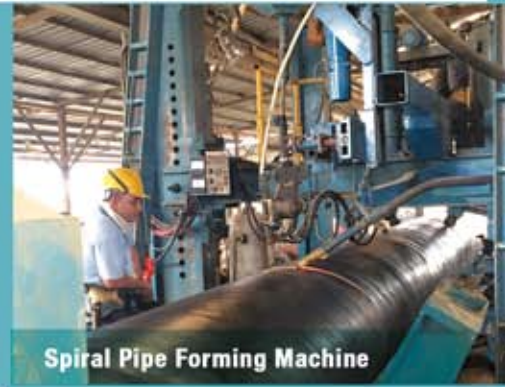
Spiral Pipe Forming Machine