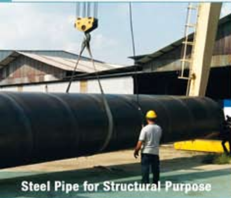
Steel Pipe for Structural Purpose