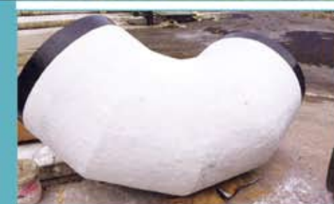
Bitumen coated fitting