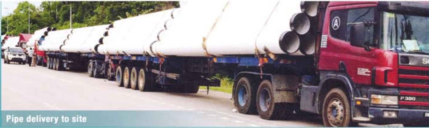
Pipe delivery to site