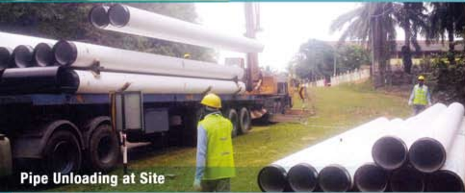
Pipe Unloading at Site